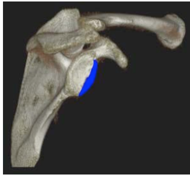
Figure 1: A 3D CT reconstruction of the scapula. The blue segment illustrates the bony deficit of the glenoid.

When bony lesions reach critical dimensions, reconstruction of this deficit using autograft bone yields the best surgical results. The Latarjet procedure is the most popular and highly effective, transferring the distal coracoid into the bony defect. 3